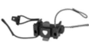
E241 Handlebar Mounting-Set QR

Handlebar mounting-set (sold separately):