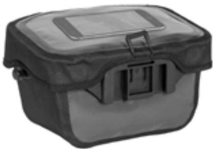
Smartphone in transparent lid compartment (not included)