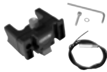
E225 Handlebar Mounting-Set