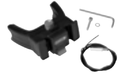
E226 Handlebar Mounting-Set E-Bike