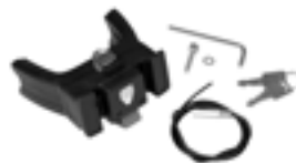
E207 Handlebar Mounting-Set E-Bike with Lock