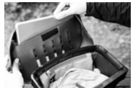
Opening lid compartment: 20,5cm / 8.1in.