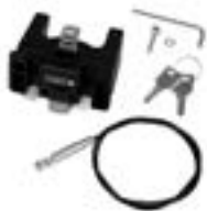
E185 Handlebar Mounting-Set with Lock