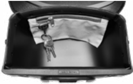
Carabiner with key chain

Handlebar mounting-set (sold separately):